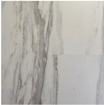
White Gold (CT-40)