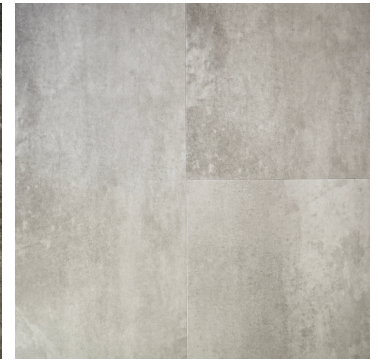
Beach Pier (CT-43)