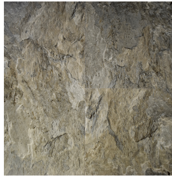
Warm Slate (CT-42)