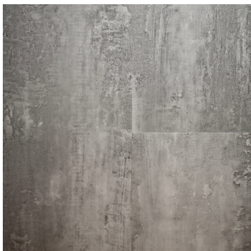
Wet Concrete (CT-48)