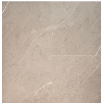
Tan Marble (CT-45)