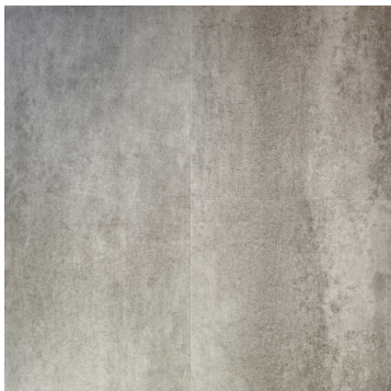
Ocean Mist (CT-44)