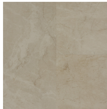
Tan Slate (CT-50)