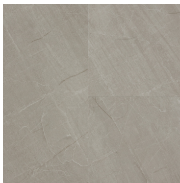
Marble Ice (CT-49)