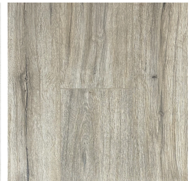
Weathered Cedar (MC-57)