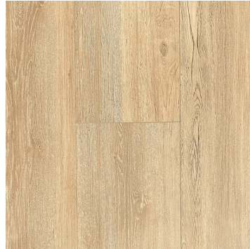
Warm Oak (MC-51)