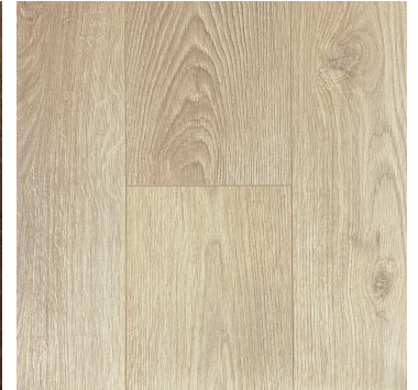
Traditional Walnut (MC-53)