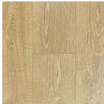
Honey Maple (MC-55)