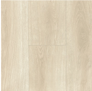
Natural Beech (MC-50)