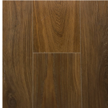
Cinnamon Teak (MC-52)