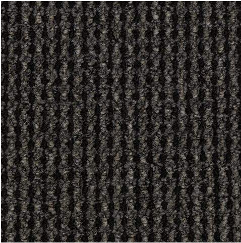
Gravel Roads (ATII-8)